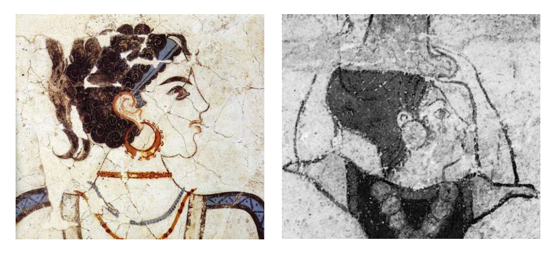
Figure 3: On the left, a saffron-gatherer woman from Thera Island (Late Bronze Age); on the right, a girl dancing with incence burner on her head from Tarquinia (6th century BCE)

Etruscan civilization coexisted with the Minoan one [28], as suggested herein by the observed linguistic affinity of the Etruscan language to other Anatolian languages contemporary to the Minoan civilization.